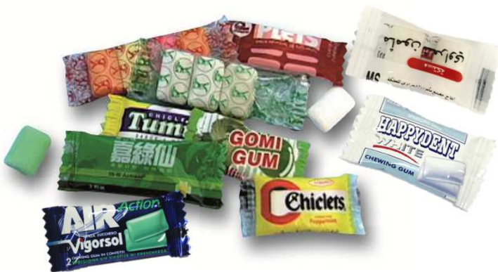
- Coated chewing gums